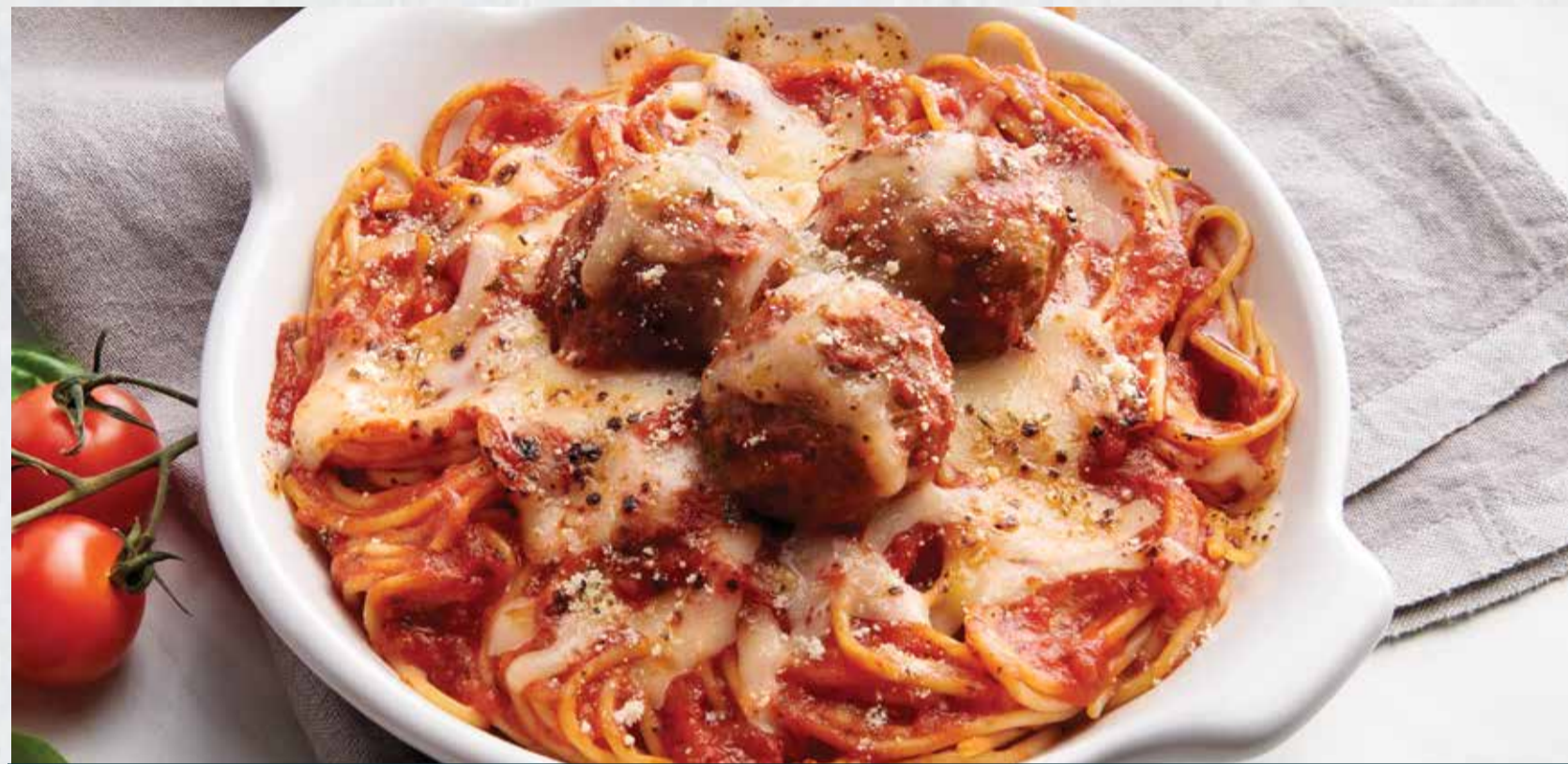
BAKED SPAGHETTI WITH MEATBALLS