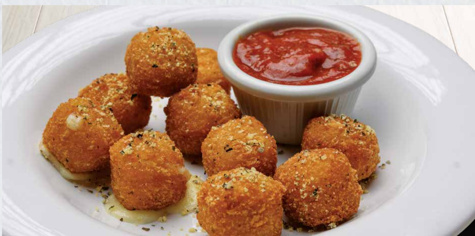
FRIED MOZZARELLA BITES

FRIED MOZZARELLA BITES (530/600 cal) 7.49 with Marinara OR Alfredo Dipping Sauce