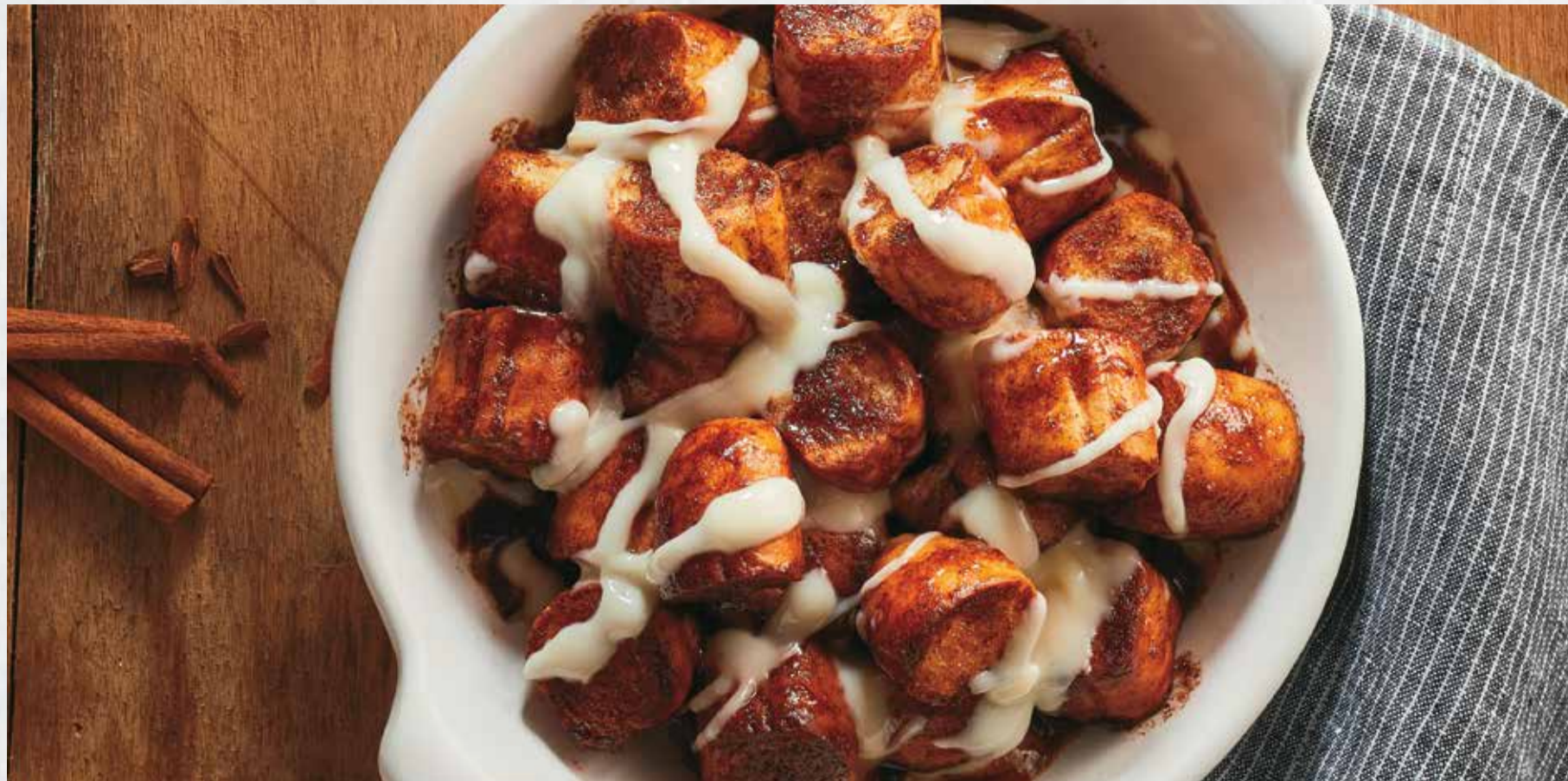
CINNAMON SWIRL BREADSTICK BITES

CINNAMON SWIRL BREADSTICK BITES (600 cal) 8.49