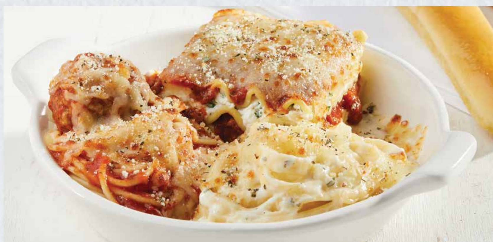
OVEN-BAKED CLASSIC SAMPLER