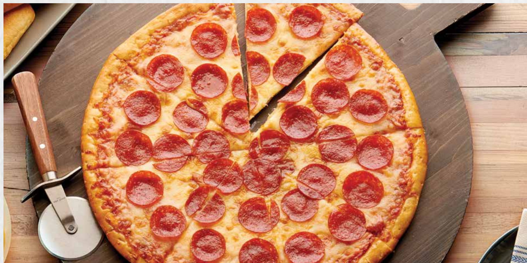
WHOLE 8 SLICES