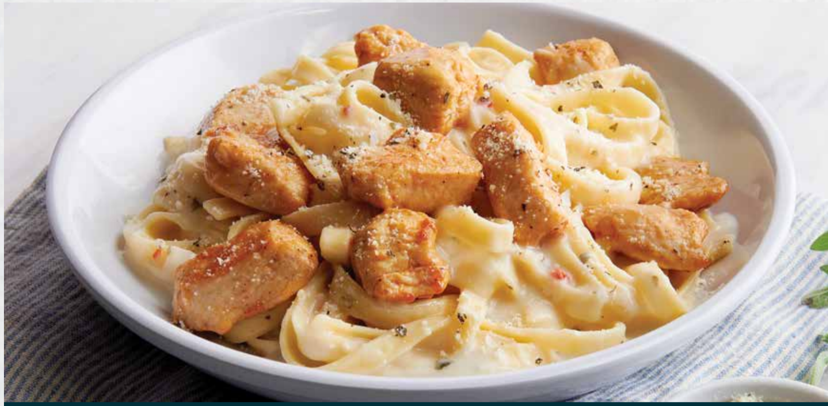
CHICKEN FETTUCCINE ALFREDO