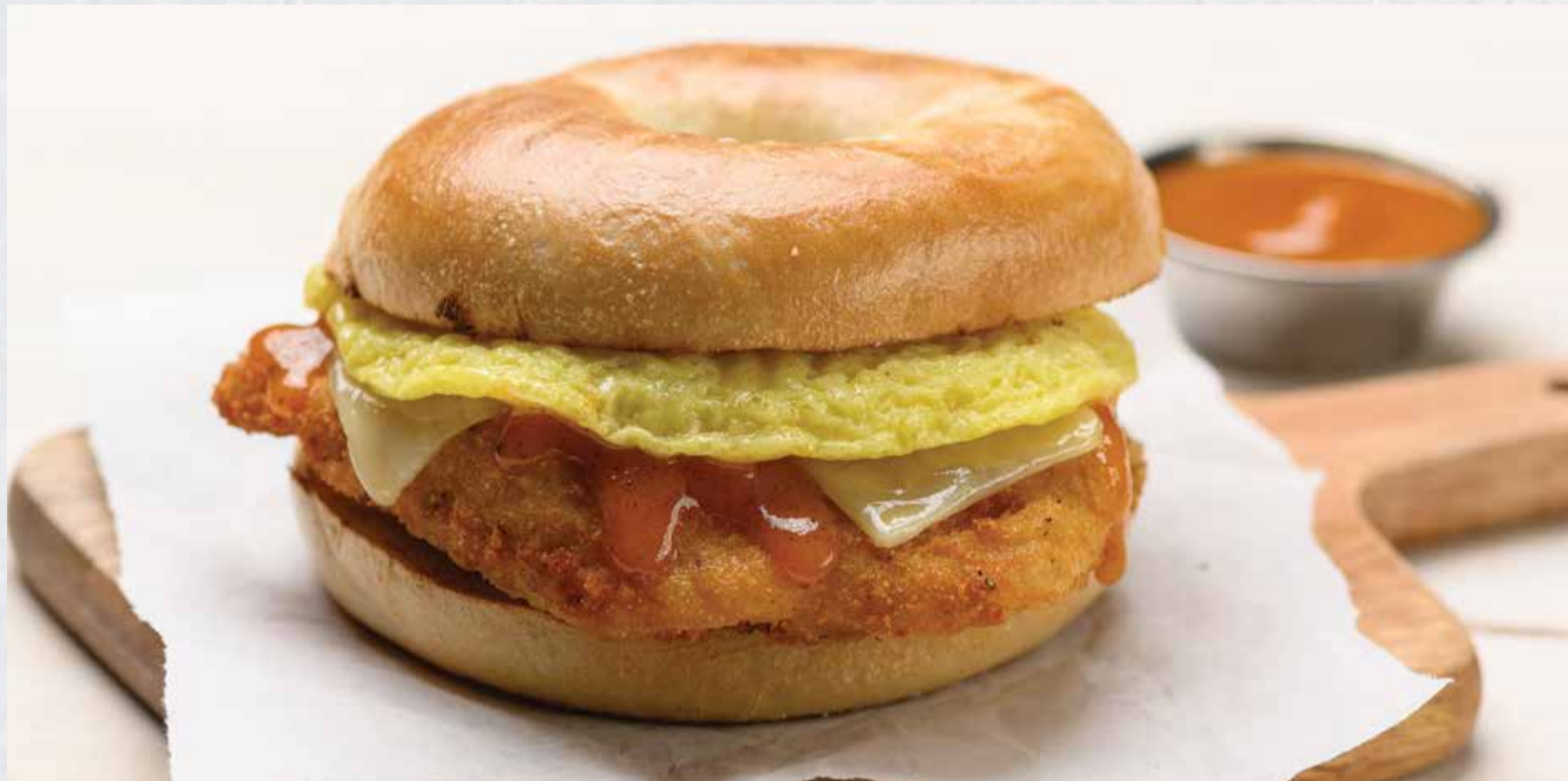
HOT HONEY CHICKEN AND EGG BREAKFAST SANDWICH

TOASTED BAGEL (360 cal) 3.49 with Cream Cheese